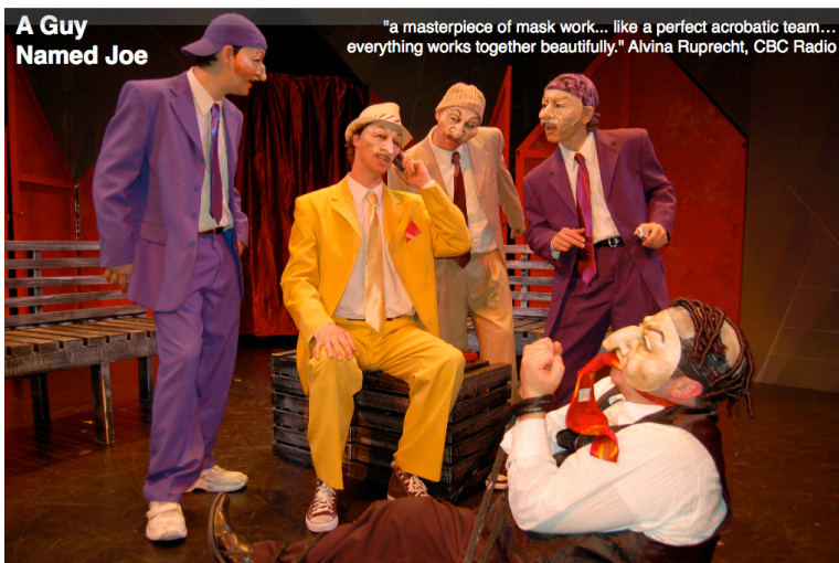
A Guy Named Joe

has been an incredible journey for me and I continue to be inspired for what comes ahead.